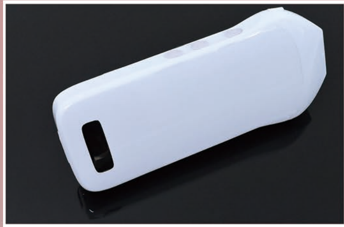
C10CS High Frequency