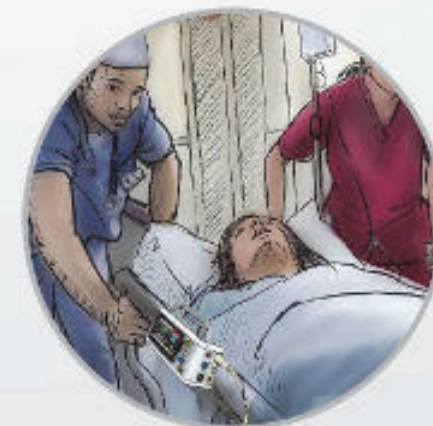
4 postpartum transfer