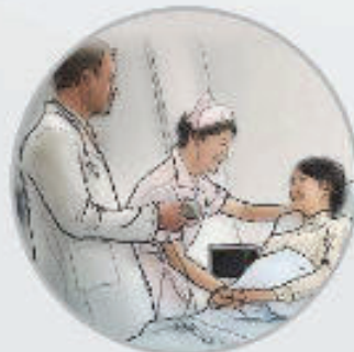
1 Ante partum checking

Specialized Obstetric Monitor C20 can meet the different requirements of all aspects