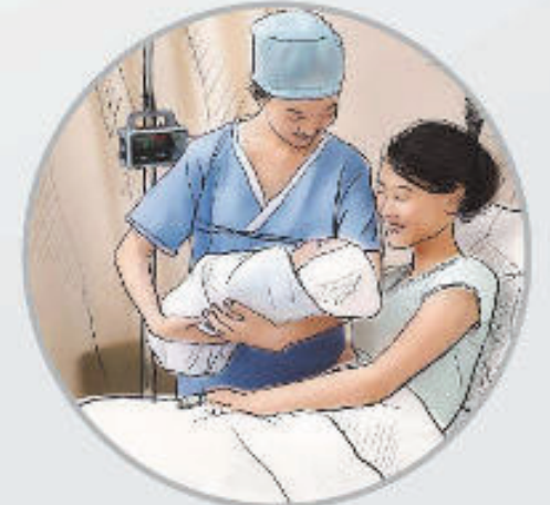
5 postpartum recovery