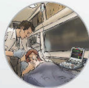
2 Ante partum first aid