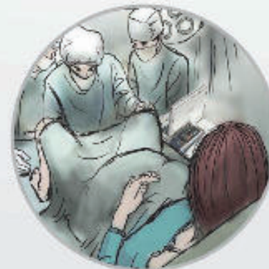
3 Monitoring during delivery