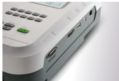
Memory of 300 ECG records; USB for data transmission; PC-ECG management system