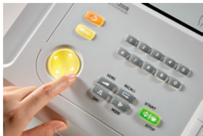
Alphanumeric keyboard; Back light for button