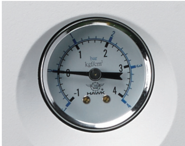
A Pressure Gauge